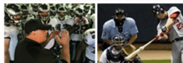
Long: Every game's a must win for Reid, Eagles